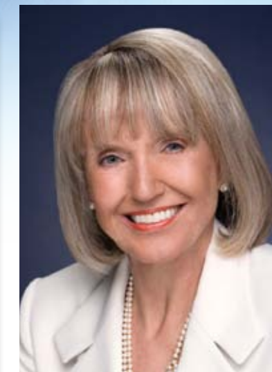
Jan Brewer Gov. Arizona