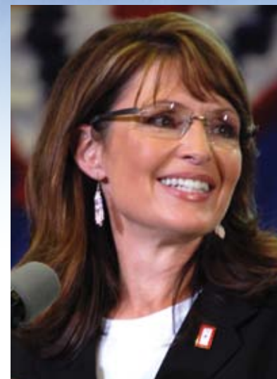
Sarah Palin Gov. Alaska