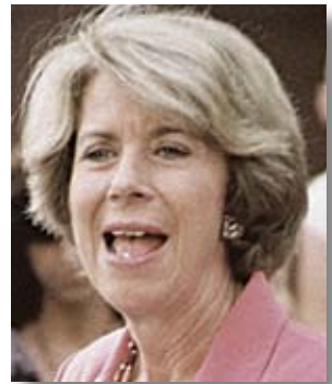
Debra Bowen Janice Hahn