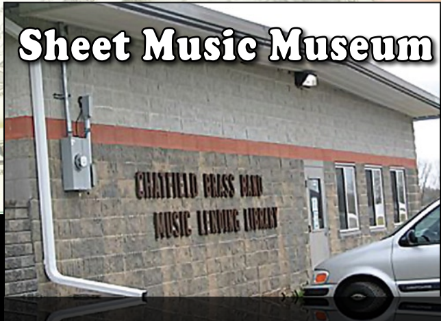
Sheet Music Museum

(Sources: HF380, 4.2.2008, pg.9689 and SF 1989, 4.19.2007, pg. 4032)