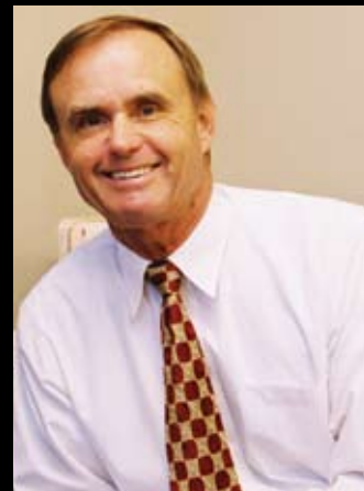
Brian Bilbray says NO

Should federal law be changed to grant Social Security benefits to Illegal Aliens and their families?